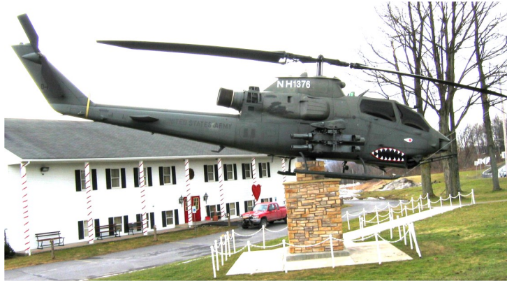
The AH1 Cobra Gunship #68-15110 "The Snake"

8616 Clinton St. New Hartford, NY 13413-3400 (315) 736-7041