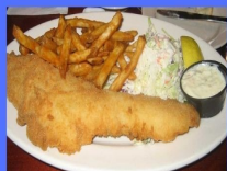
FISH FRY DINNER $15 DONATION

New Hartford Sons of the American Legion