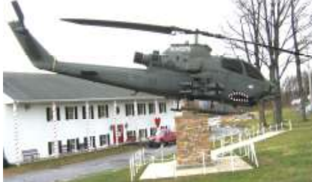
The AH1 Cobra Gunship "The Snake" 8616 Clinton St. New Hartford, NY 13413-3400 (315) 736-7041